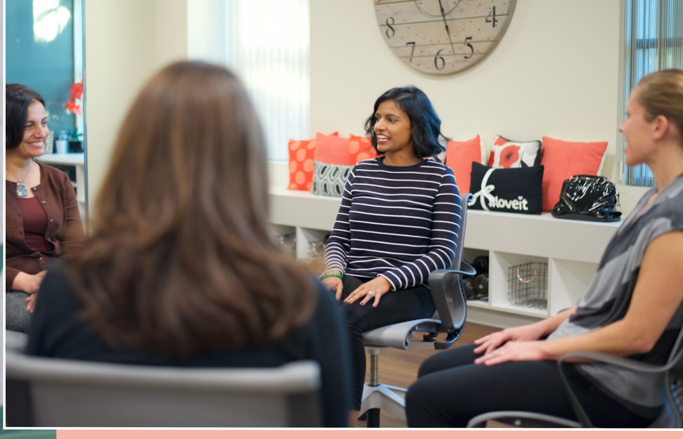
Patients seek out holistic wellness services and support from fellow previvors.