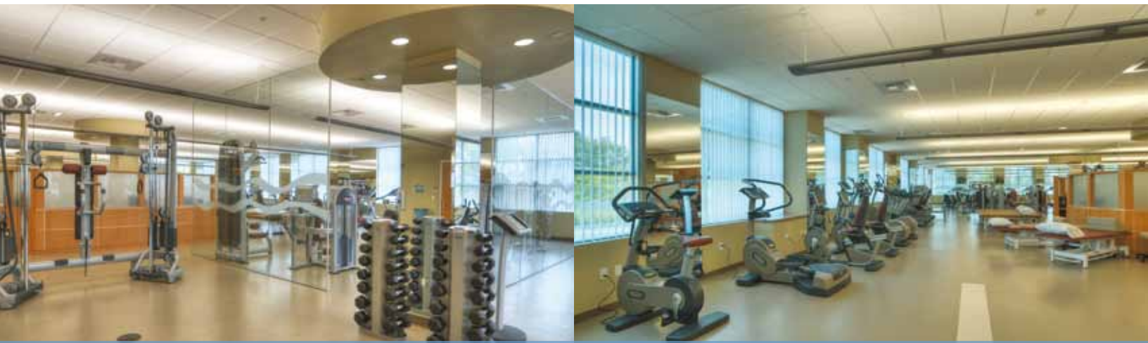
Maggie's Gym, Hoag's State-of-the-art Cardiac Rehabilitation Center

Non-Profit Organization U.S. Postage PAID Permit # 199 Newport Beach, CA