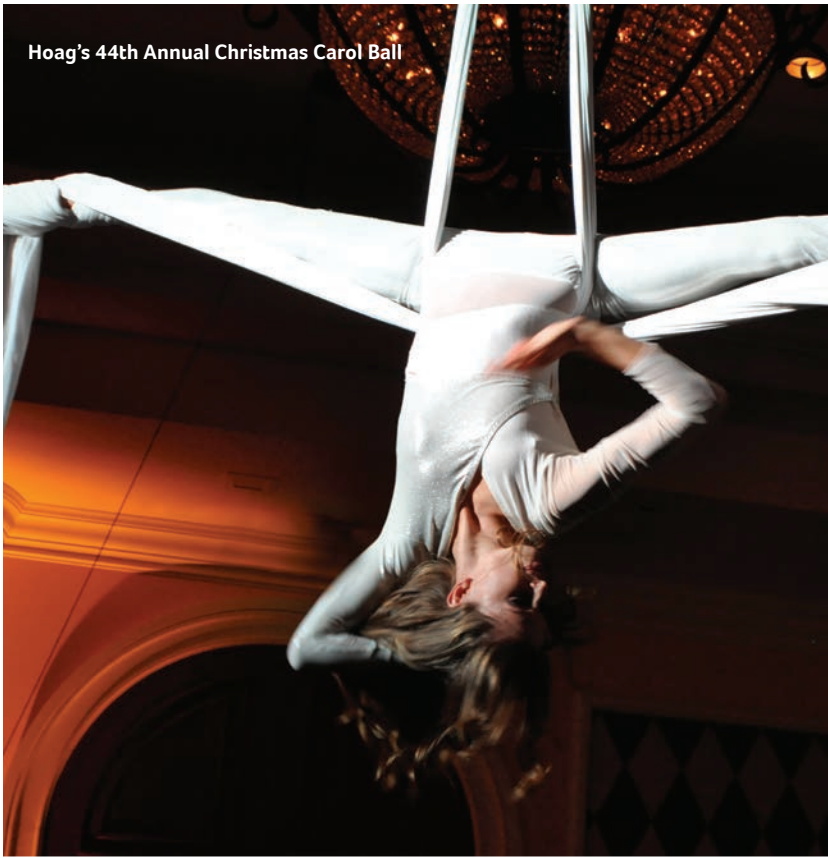
Hoag's 44th Annual Christmas Carol Ball