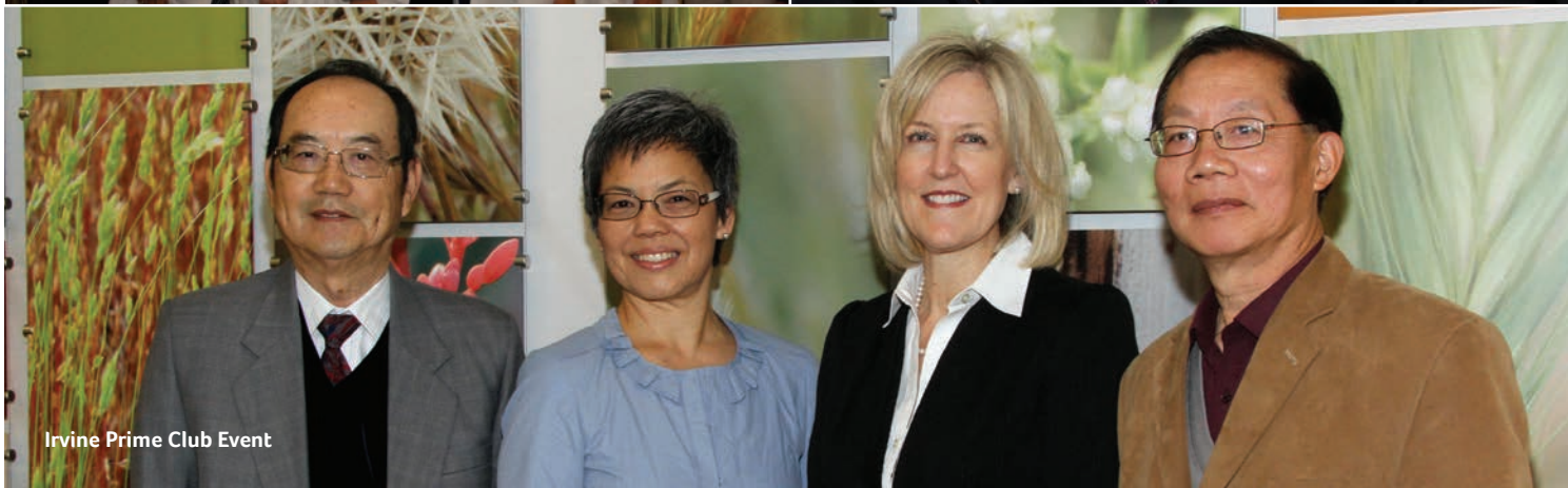
Irvine Prime Club Event