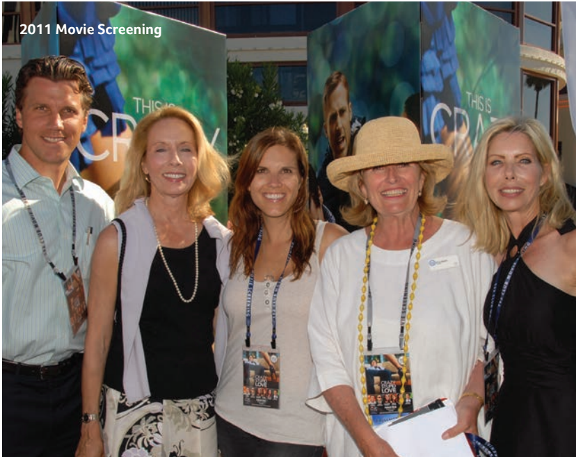
2011 Movie Screening