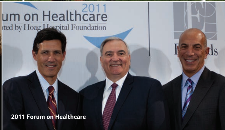
2011 Forum on Healthcare