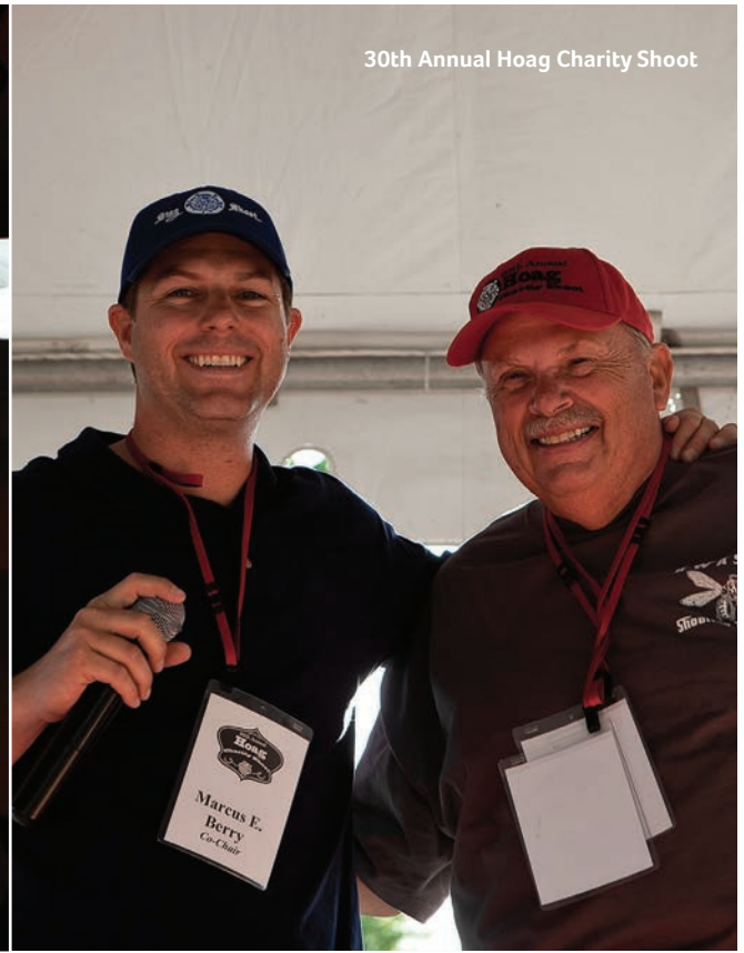
30th Annual Hoag Charity Shoot