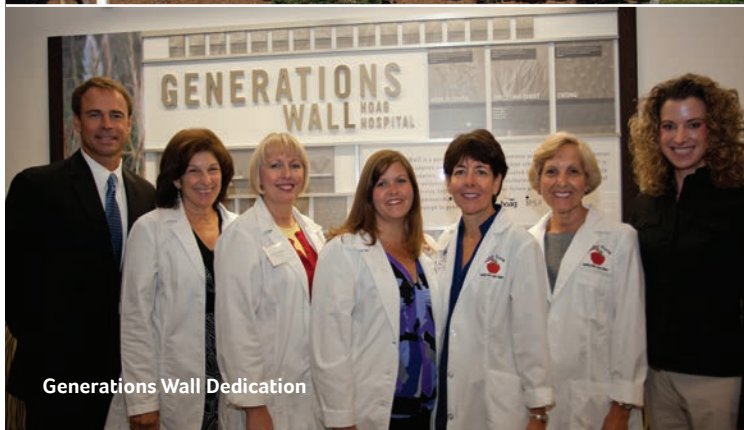
Generations Wall Dedication