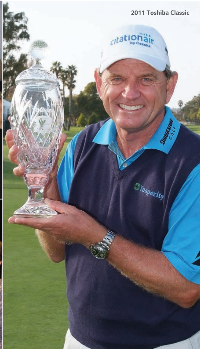
2011 Toshiba Classic