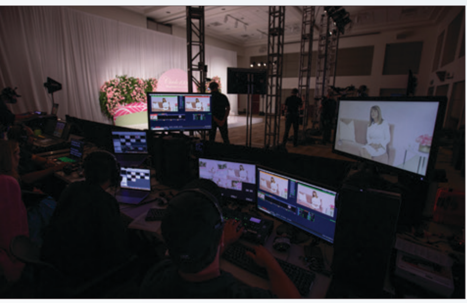
A crew of expert technicians managed the event livestream