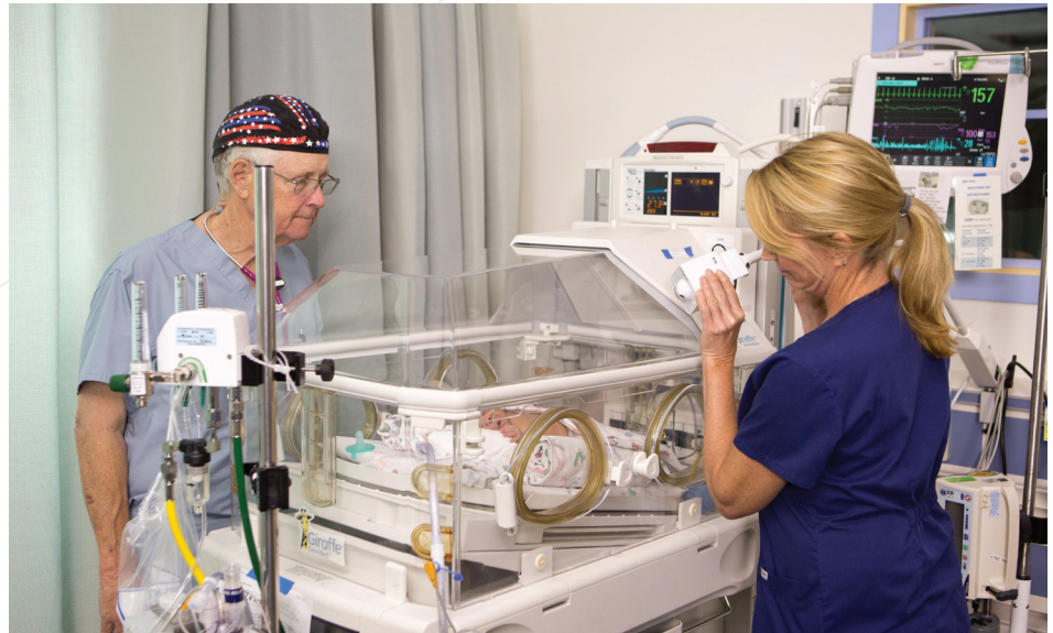
Hoag nurse adjusts NICVIEW camera for a better look at baby