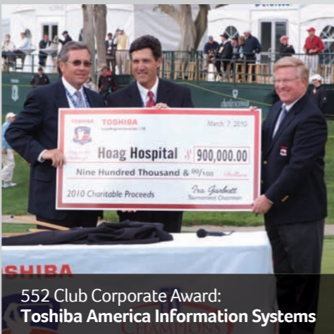
552 Club Corporate Award: Toshiba America Information Systems